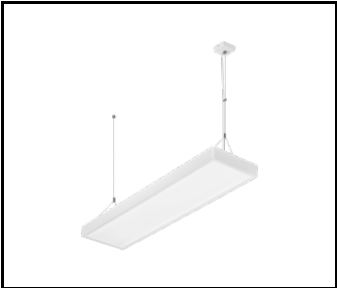
CONTRA LED suspension system 1200x300 (374692)