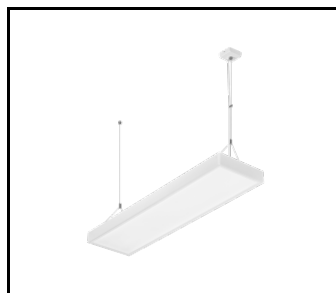
CONTRA LED suspension system 1200x300 (374692)