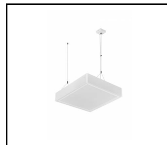
CONTRA LED suspension system 600x600 (374685)