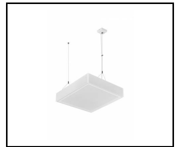
CONTRA LED suspension system 600x600 (374685)