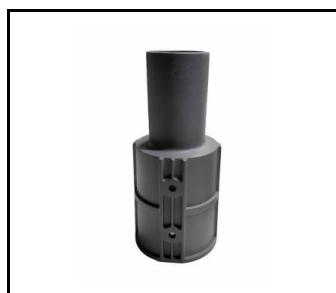
Pole adapter 80/60 ALU (598357)