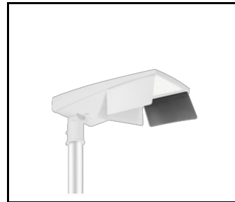
Backshield L (left) Tiara 2 LED M (UL00960)