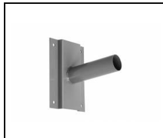
wall holder (galvanized) (314049)