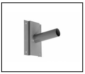
wall holder (galvanized) (314049)