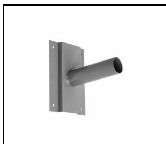
wall holder (grey) (314056)