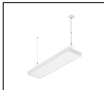
CONTRA LED suspension system 1200x300 (374692)