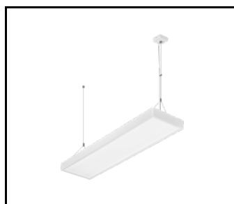
CONTRA LED suspension system 1200x300 (374692)