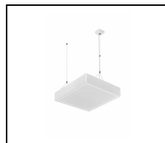
CONTRA LED suspension system 600x600 (374685)