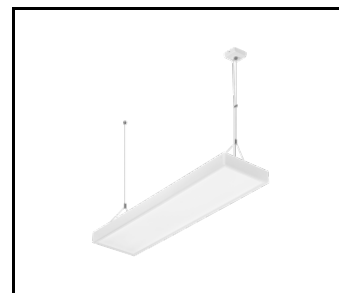
CONTRA LED suspension system 1200x300 (374692)