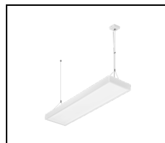
CONTRA LED suspension system 1200x300 (374692)