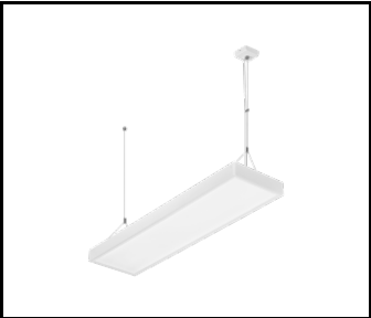
CONTRA LED suspension system 1200x300 (374692)