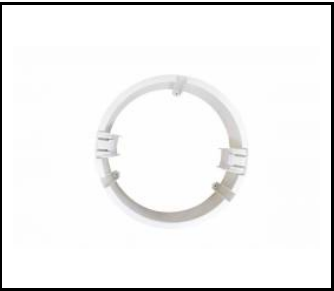
NECTRA LED IP44 20W / 25W SURFACE CASEING PC (ø220 / 70) (059995)