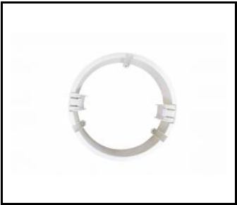
NECTRA LED IP44 20W / 25W SURFACE CASEING PC (ø220 / 70) (059995)