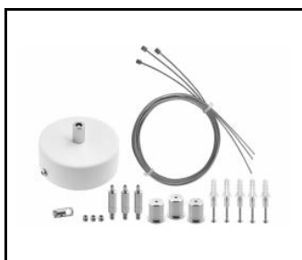
Coria Hang set 2 fi 100 white dali (556708)