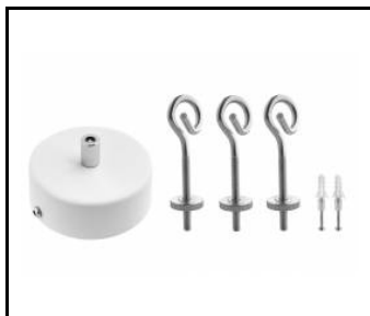
Coria Hang set 1 fi 100 white dali (556661)