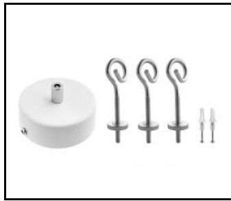
Coria Hang set 1 fi 100 white dali (556661)