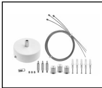
Coria Hang set 2 fi 100 white dali (556708)