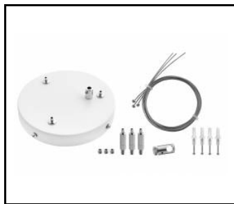
Coria Hang set 3 fi 150 white dali (556746)