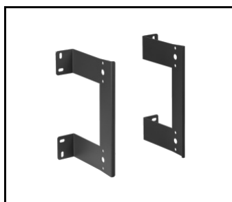
FACTOR LED HB surface mount bracket double 2M (987991)