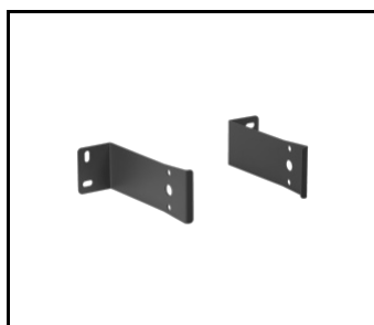
FACTOR LED HB surface mount single 1M (987984)