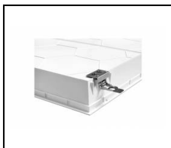
Plasterboard mounting brackets (4 pcs) (630033)