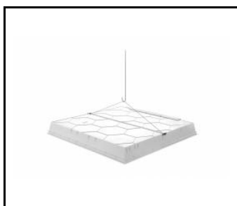
Safety suspension (modular ceiling) (904349)