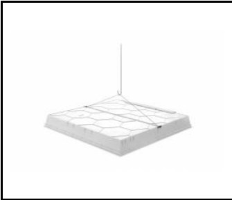
Safety suspension (modular ceiling) (904349)