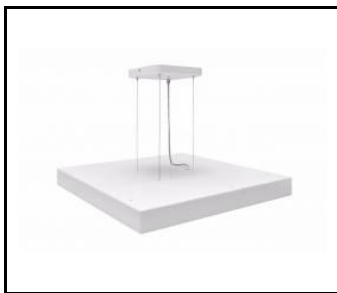
COMPACT LED EVO Z - SYSTEM ZWIESZANIA