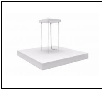
COMPACT LED EVO Z - SYSTEM ZWIESZANIA