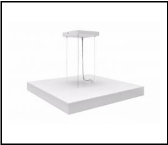
COMPACT LED EVO Z - SYSTEM ZWIESZANIA

Card creation date: 11 July 2025 The company reserves the right to make design changes or upgrades in the presented product. Product data sheet does not constitute an offer. * Parameter tolerance is +/- 10%