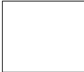
TIARA 2 LED Adjustable bracket Dark Sky diameter 64 mm grey (804625)