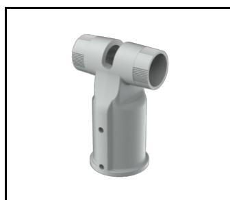
TIARA 2 LED Adjustable bracket Dark Sky diameter 64 mm grey (804625)