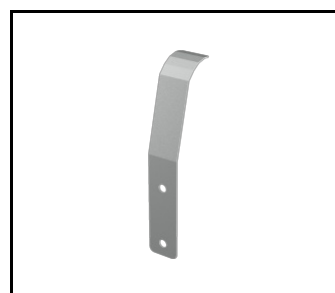
Tiara 2 LED 64mm handle cover (989766)