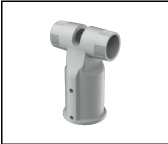
TIARA 2 LED Adjustable bracket Dark Sky diameter 64 mm grey (804625)