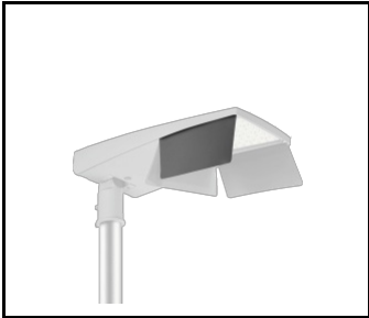
Backshield P (right) Tiara 2 LED M (UL00959)