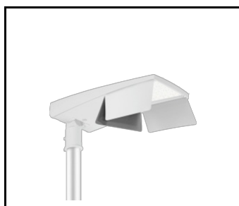
Backshield T (back) Tiara 2 LED M RAL9006 (MOQ 80szt.) (UL00958)