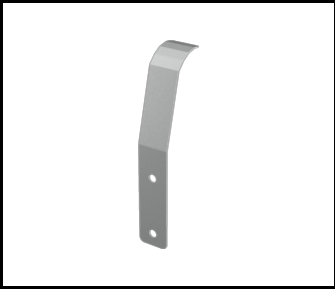
Tiara 2 LED 64mm handle cover (989766)