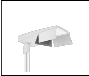
Backshield T (back) Tiara 2 LED M RAL9006 (MOQ 80szt.) (UL00958)