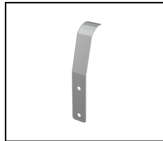
Tiara 2 LED 64mm handle cover (989766)