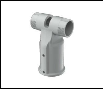
TIARA 2 LED Adjustable bracket Dark Sky diameter 64 mm grey (804625)