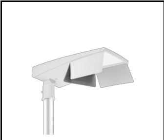
Backshield T (back) Tiara 2 LED M RAL9006 (MOQ 80szt.) (UL00958)