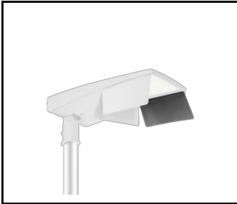
Backshield L (left) Tiara 2 LED M (UL00960)