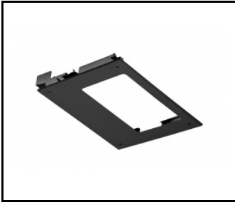
QUEST 2 LED L - recessed frame (699986)