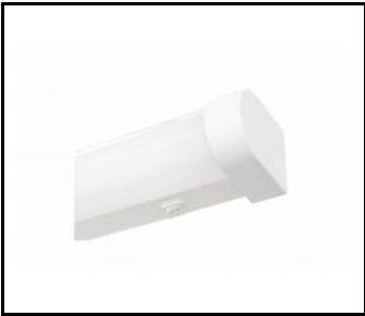
mirra led detal 1