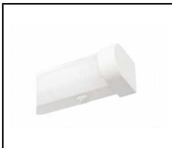
mirra led detal 1