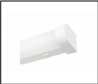
mirra led detal 1