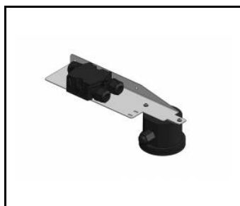
ARENA LED - RCR sensor - set (483240)