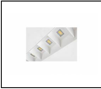
TERRA 2 LED