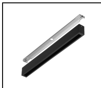
Terrano surface-mounted frame. matt black RAL9005, 573x38x60 – side opening + cable gland (583698)