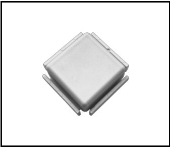
Terrano white connector (937408)