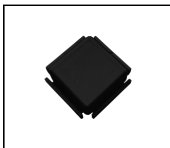
Terrano black connector (937415)