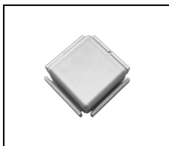
Terrano white connector (937408)