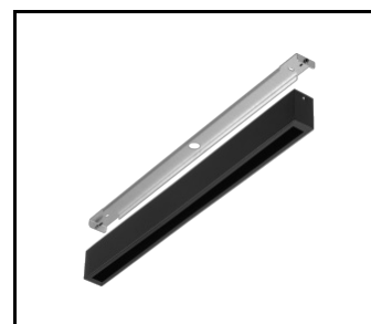
Terrano surface frame black mat RAL9005 573x38x60 (420948)