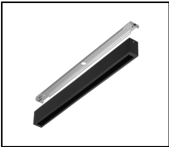
Terrano surface frame black mat RAL9005 573x38x60 (420948)