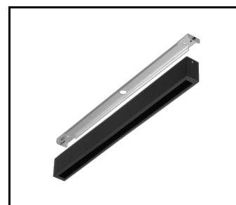
Terrano surface frame black mat RAL9005 573x38x60 (420948)