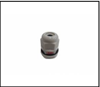
Breathable gland gray M20*1.5 IP68 (16000507)