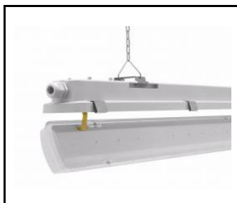
system zwieszania klosza / suspension system of the diffuser / hängende Diffusor