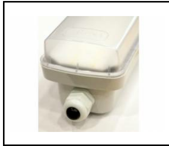
M16 stuffing box plug various PA black M-16 - BPM-21 (60000006)