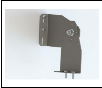
TYTAN LED. ATLAS LED. INDUSTRY LED - adjustable handle (set of 2) (908200)