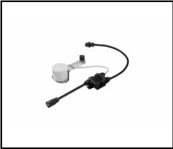
OCULUS LED - RCR motion sensor (964244)