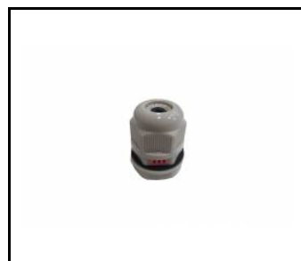
Breathable gland gray M20*1.5 IP68 (16000507)